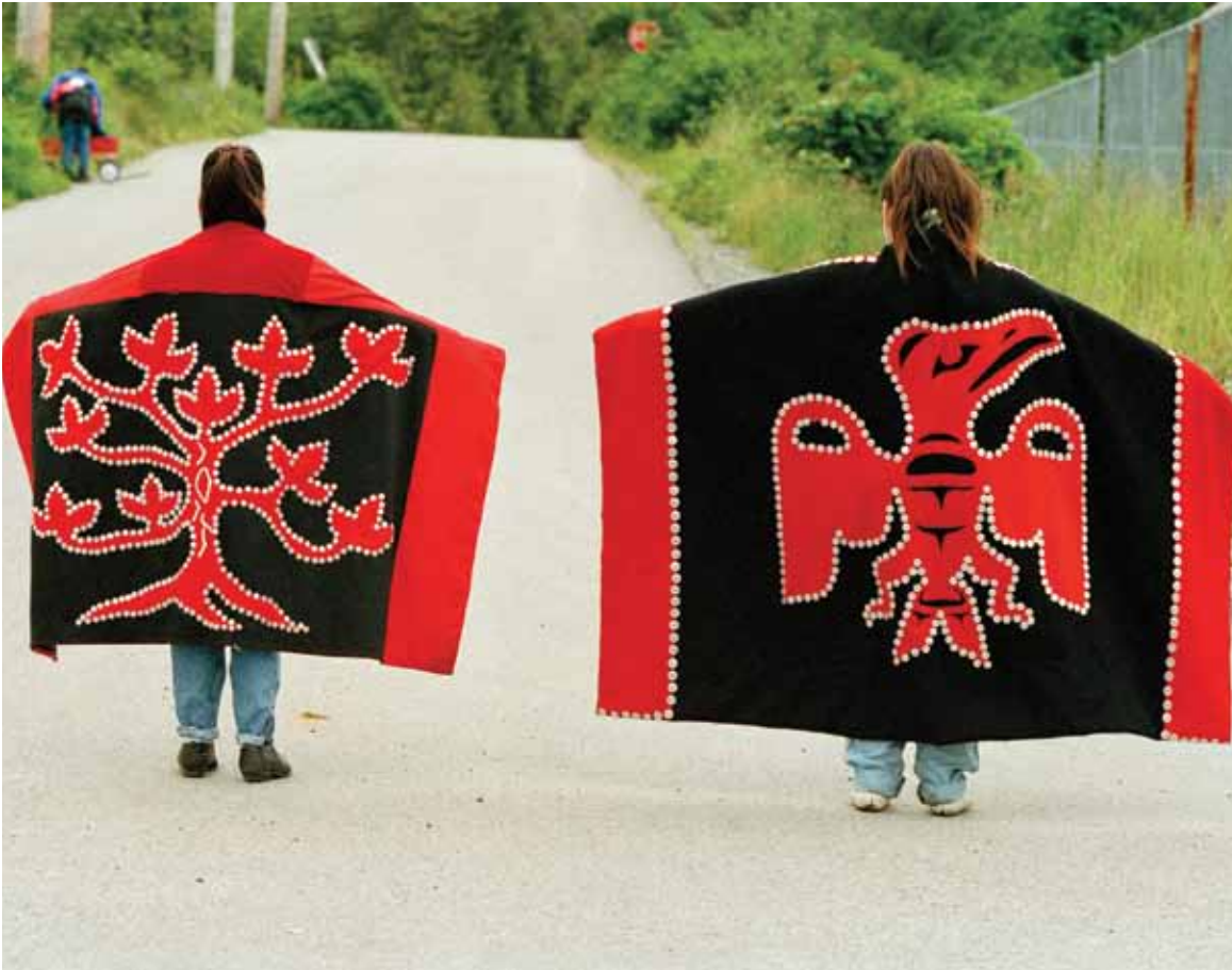
Two members of the Quileute Nation displaying the intricate patterns of their button blankets, during the Qatuwas Festival of the indigenous nations of the Pacific Rim.