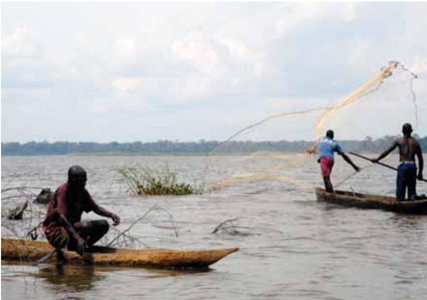
Men from the indigenous Baka settlement of Moscow Village fish in pirogues on the Oubangi River, in the northern Likouala Province of Congo.