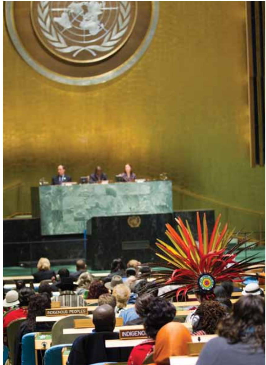
Opening ceremony of the Twelfth session of the UN Permanent Forum on Indigenous Issues.

When reading this Guide, the reader should keep in mind that the use of the term "indigenous peoples" includes all indigenous men, women and potentially vulnerable persons, such as children, the elderly, and persons with disabilities. Article 44 of the UN Declaration specifically notes that all rights