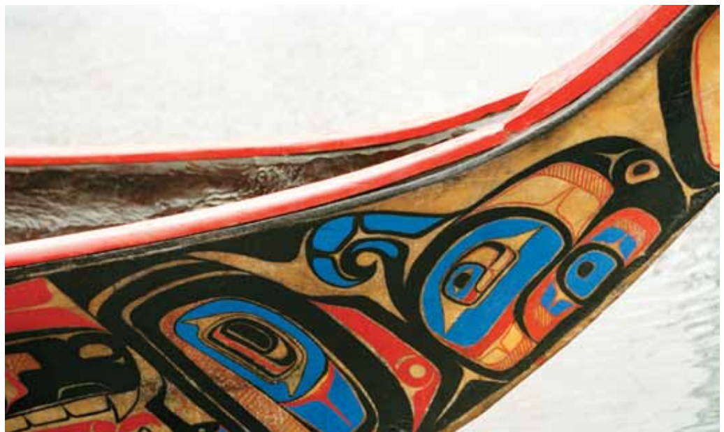
A Heiltsuk canoe or "Glwa" at the Qatuwas Festival, an international gathering of maritime indigenous nations of the Pacific Rim, Bella Bella, Canada.