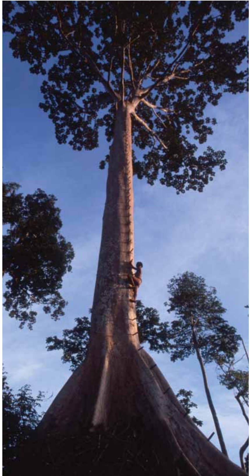
Forests are critical to the livelihoods of indigenous peoples who live in Bukit 12 National Park, in Jambi Province, Sumatra, Indonesia.

Support indigenous peoples' initiatives to map the territory they occupy using their own cultural and territorial references ("ethno mapping"). For example, an international technology company worked with an indigenous tribe in the Brazilian Amazon to create a publicly-available and interactive cultural map in order to capture, share and preserve the natural and cultural richness of the tribe's ancestral lands and territories. This interactive map also tracked instances of illegal logging to protect the environmental integrity of their land.