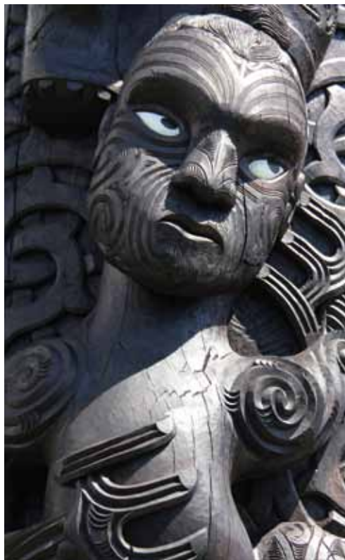
A carving of Tinirau, the son of Tangaroa – the deity of the oceans in Maori culture. Tinirau is best known for the friendship he shared with a great whale.

A global energy company decided not to operate in a reserve for indigenous peoples living in isolation in Peru despite acquiring a license to operate in the area by national authorities.