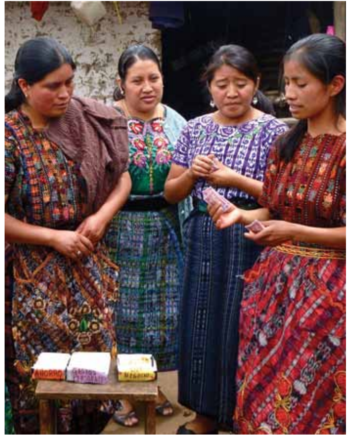
Mercado Global partner artisans at a financial literacy training in their community in the Guatemalan highlands.

business operations that employ indigenous peoples for the exploration of natural resources in their territories;