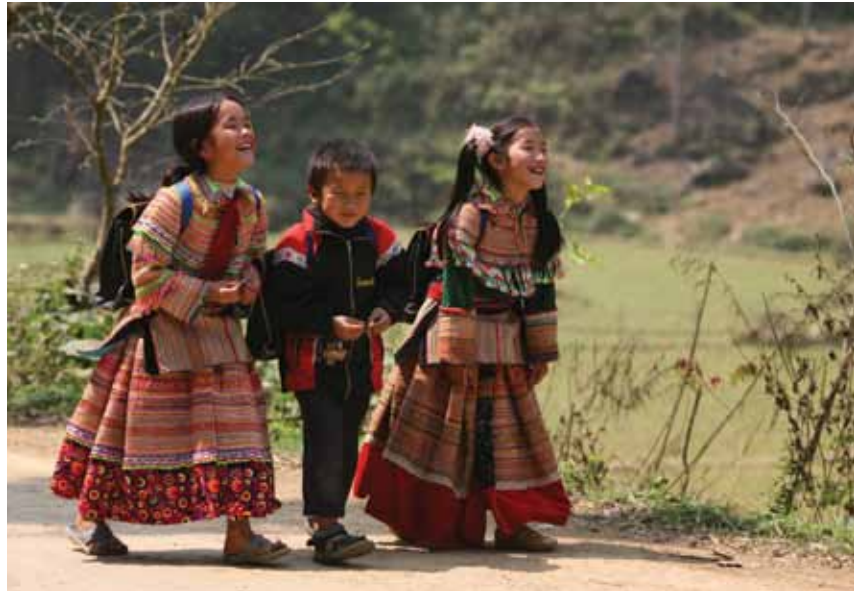
Children laugh while walking home from school, in an indigenous community in Bac Han District in Lao Cai Province, Vietnam. The children attend a school which includes classes taught in the children's indigenous language.