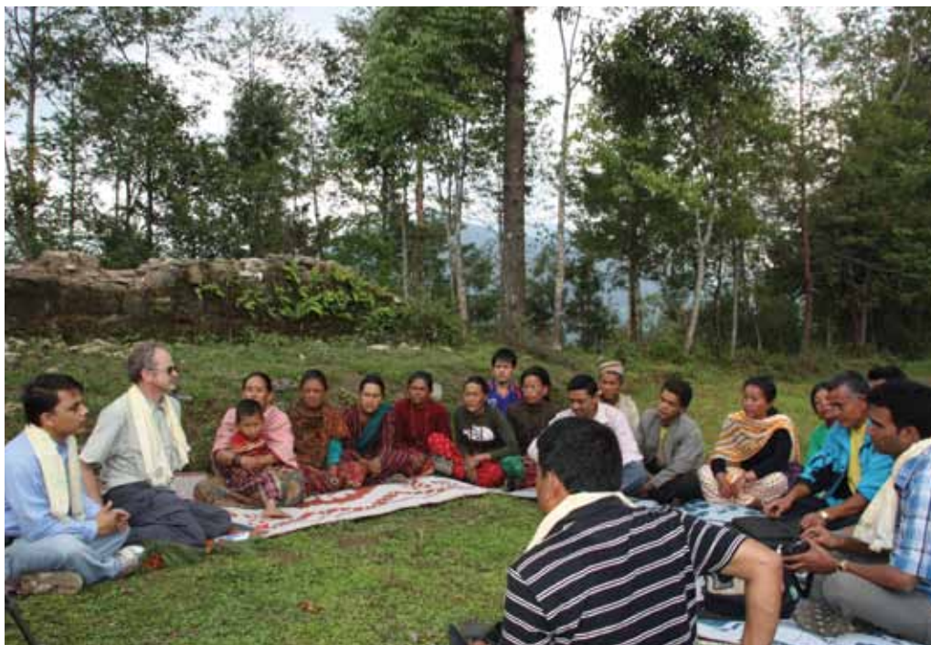
An Estee Lauder representative holds a consultation with a Dolakha community in Nepal.