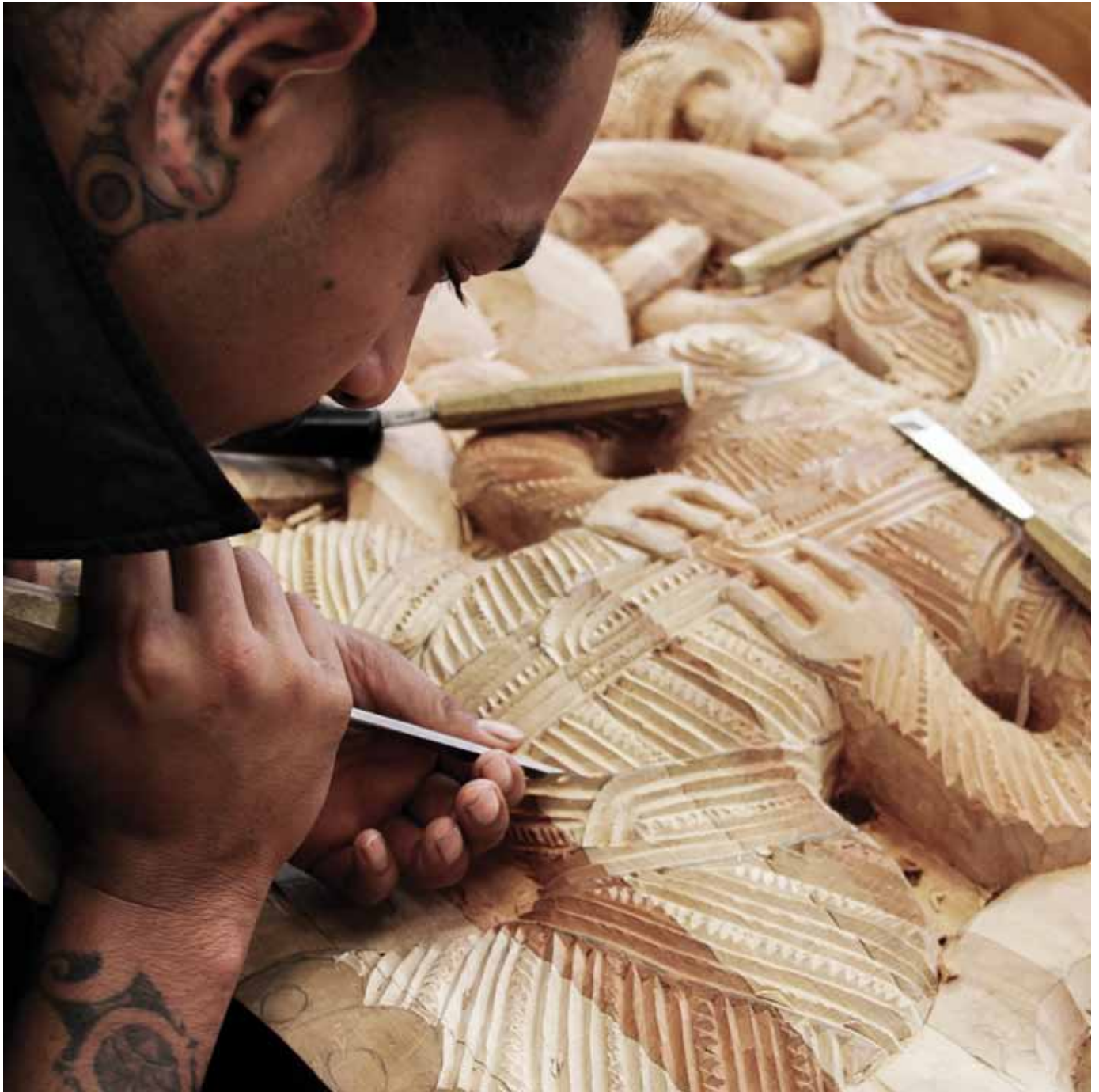
A Maori carver has been supported by his iwi (tribe) to study the time-honoured practice of Maori carving at the New Zealand Maori Arts and Crafts Institute.