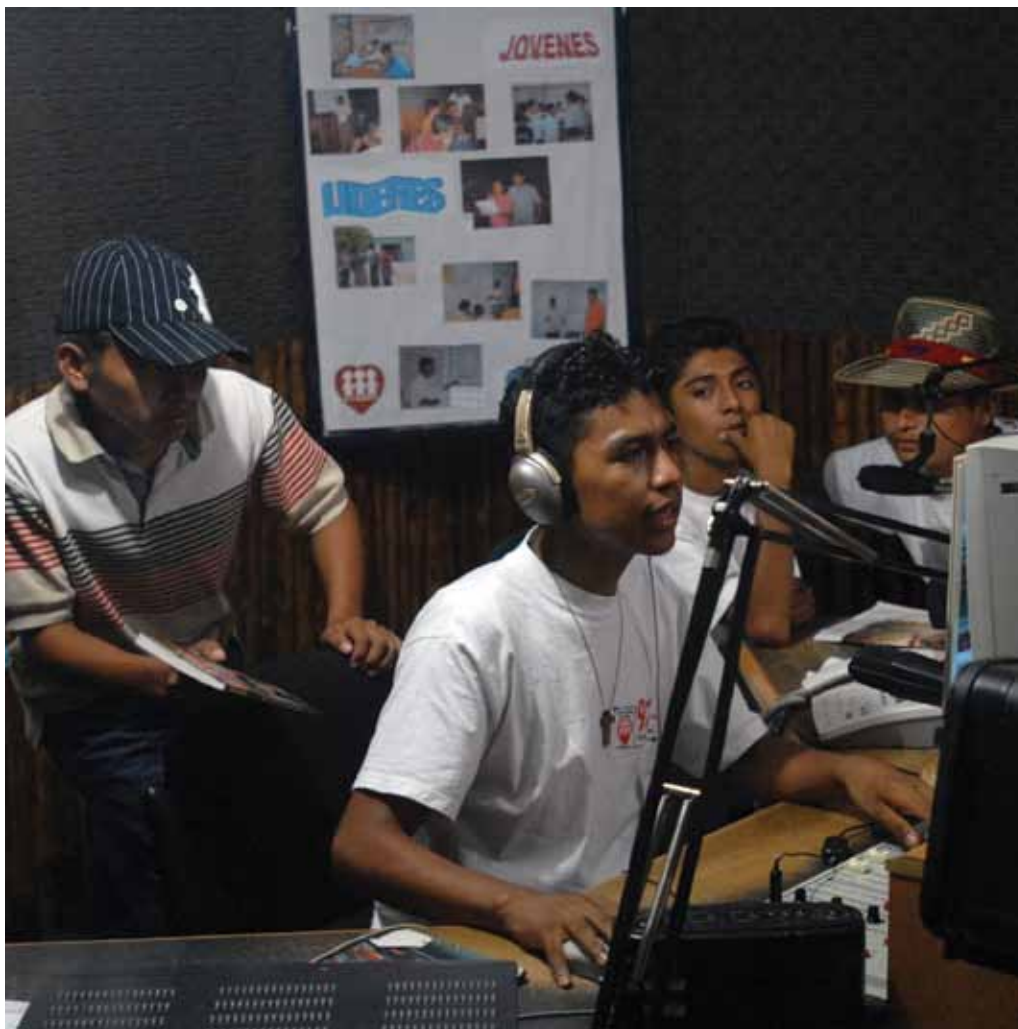
Wayuu youth producers tape the radio programme "Ouliwou," about indigenous Wayuu language and culture, in the north-western state of Zulia, Venezuela.