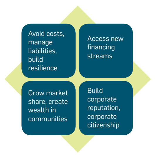
FIGURE 2. THE BUSINESS CASE FOR CLIMATE CHANGE ADAPTATION

Eskom integrates climate change adaptation analysis and responses into existing proce-