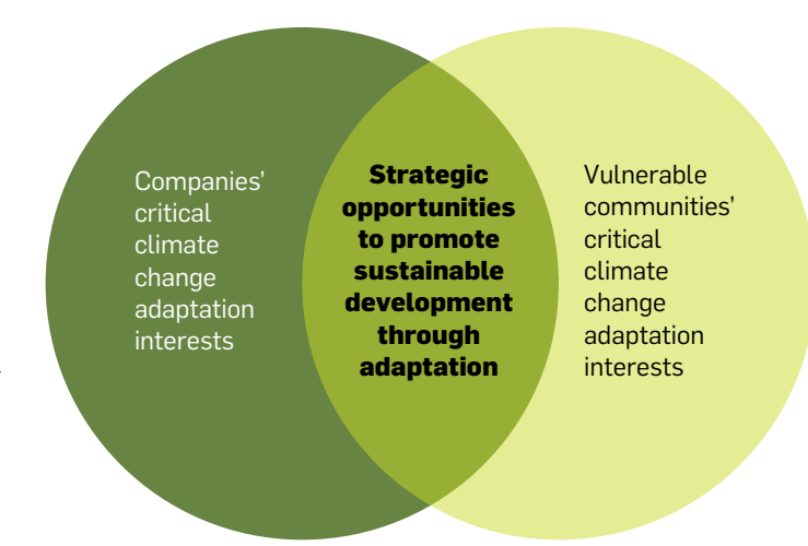
FIGURE 1. THE STRATEGIC NEXUS FOR PRIVATE SECTOR ADAPTATION EFFORTS

The companies profiled here see a clear and robust business case for strategic engagement in adaptation at the nexus of company needs and community needs to support sustainable development (see Figure 1). Companies see the inextricable connections between their ability to operate and prosper and the wellbeing of the communities that comprise their value chain: suppliers, employees, customers, and people living in the areas in which they operate. Companies are committed to tackling business challenges and community challenges in an integrated fashion. They actively seek out opportunities to create shared value. For example, Coca-Cola's water stewardship platform has enabled the company to view long-term watershed health and community well-being as essential to bottling plant performance and corporate growth, and they